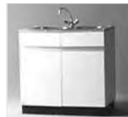
38051 Rental sink unit (Similar model shown)

Please note on the use of commercial dishwashers: The use of commercial dishwashers with a rinse cycle of two minutes or less and the preparation or demonstration of products containing grease and/or oil requires the use of grease traps for the wastewater being discharged (see order form 5.8) (see also "Water connection and supply terms" on page 3).